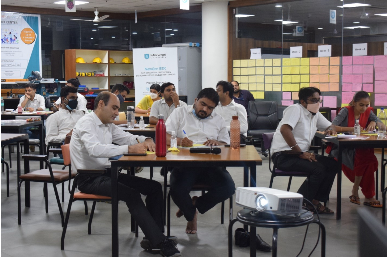
Glimpse of activities performed by participants.