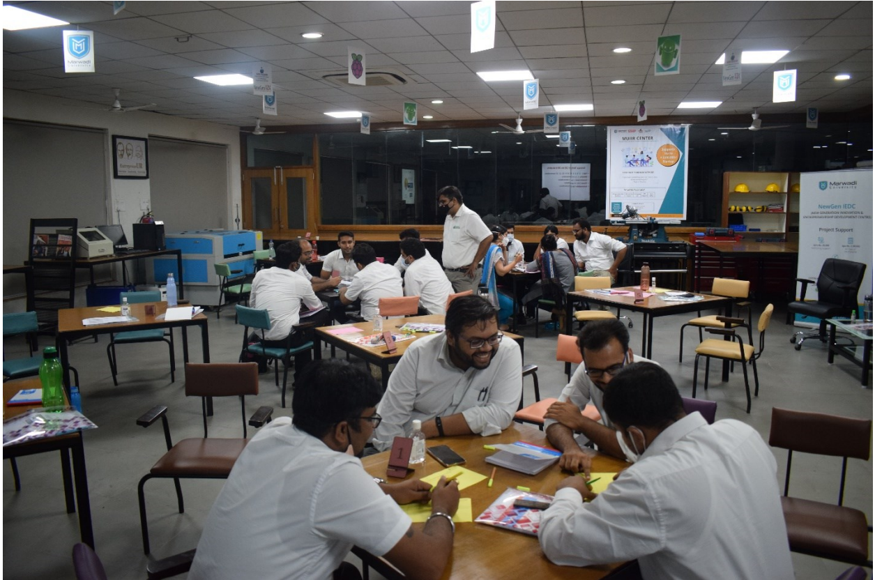
Glimpse of activities performed by the participants.