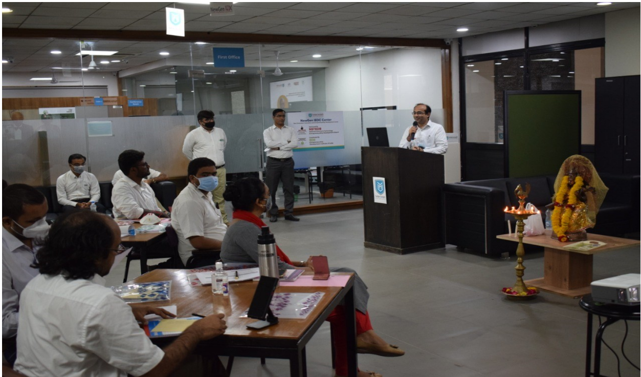
Glimpse of the welcoming speech by the Dignitaries of University