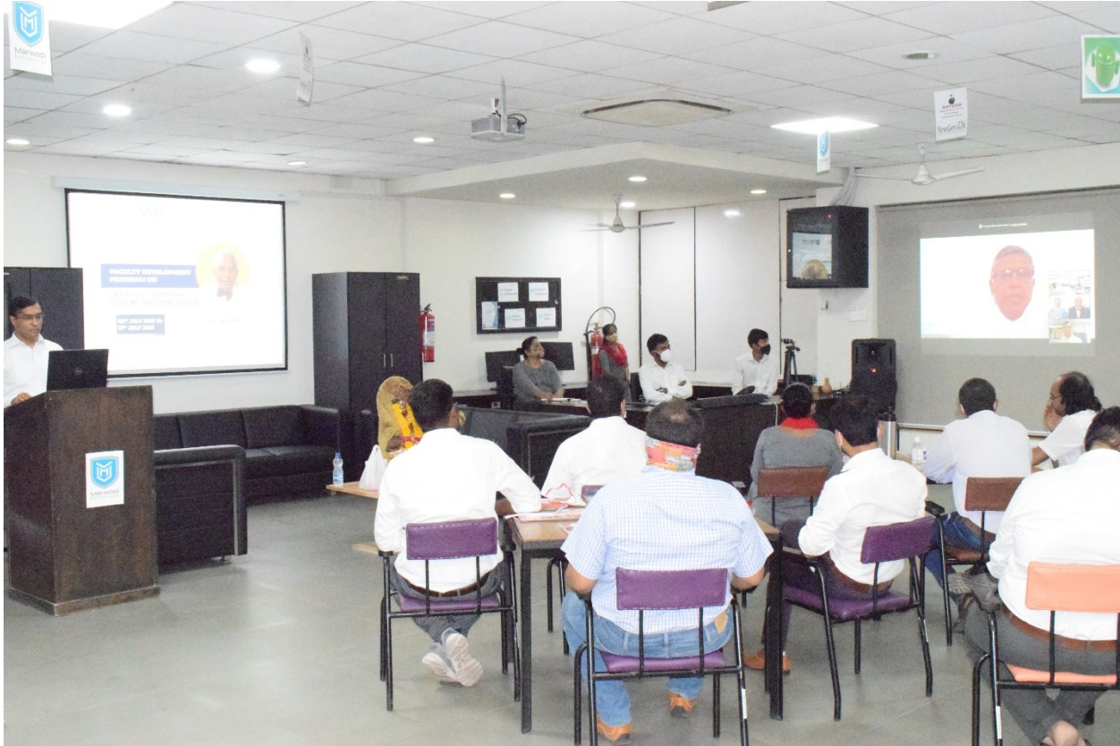
Glimpse of insight shared by the expert to the participants.