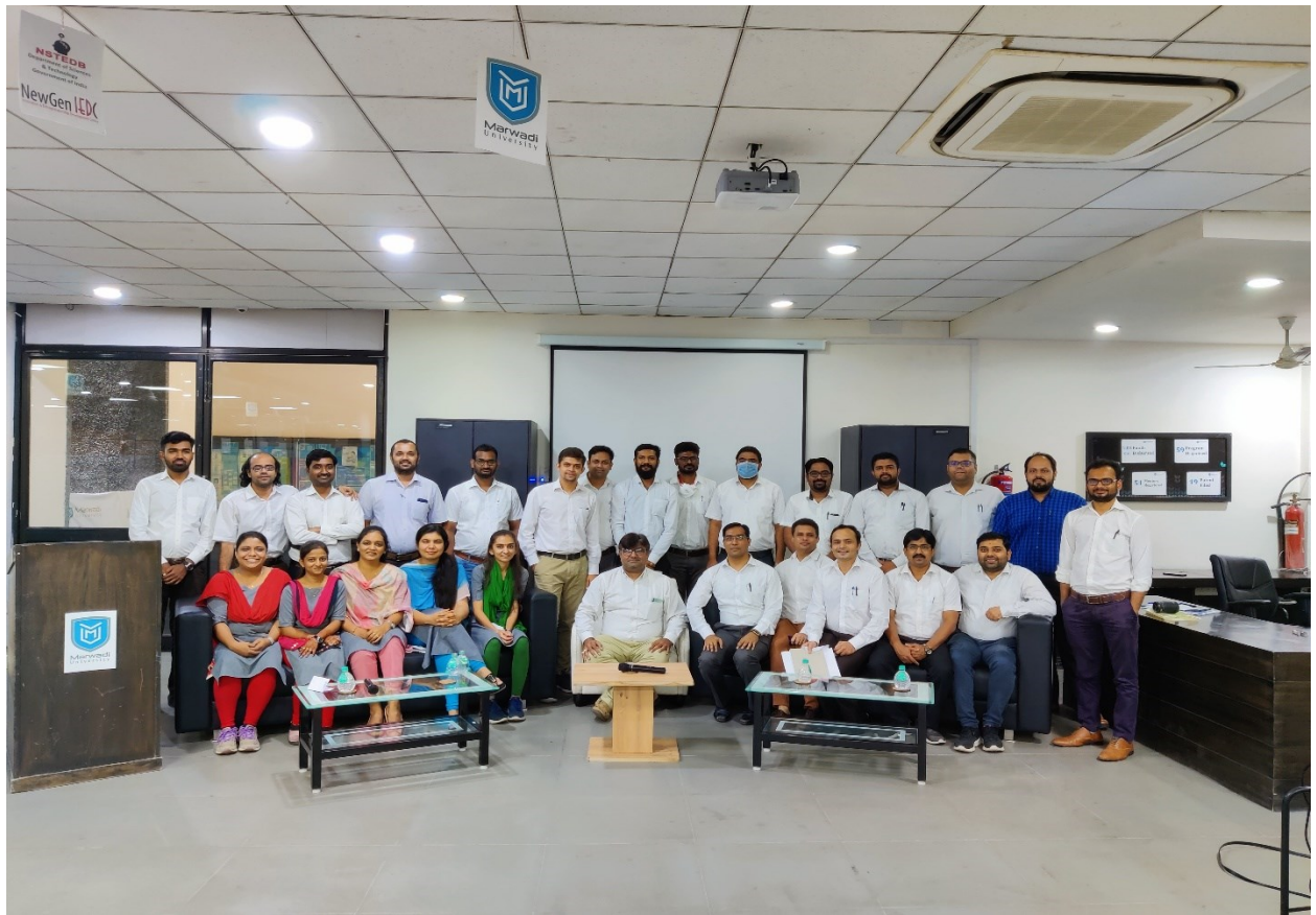
Glimpses of activities performed by the participants.